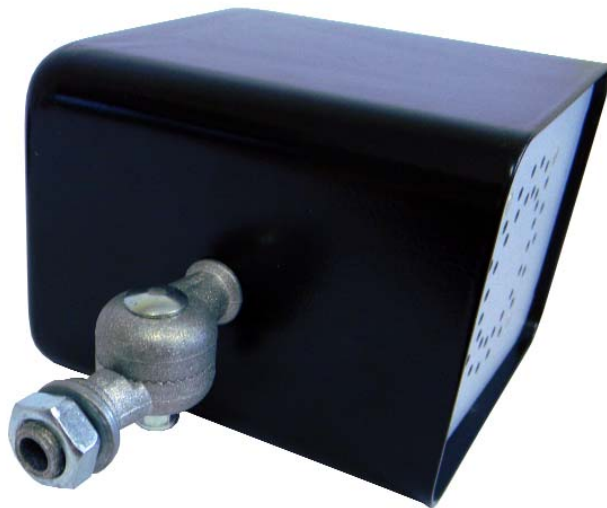
The APS-10 features an easily adjustable mount that requires only a single 1/2" (13mm) hole to install