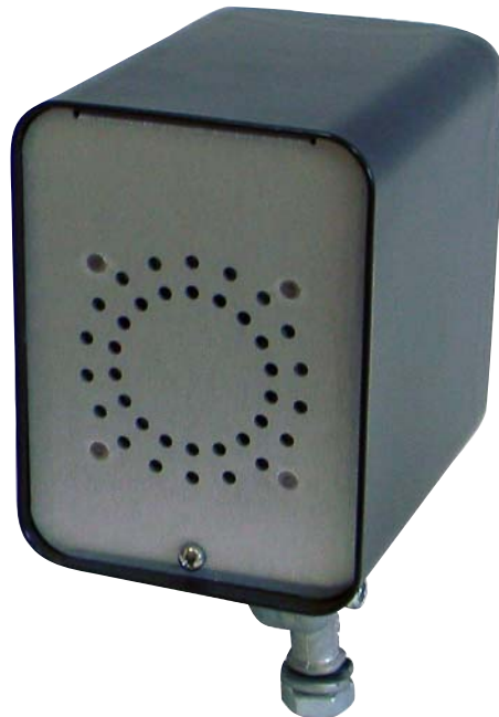
Peek APS-10 Audible Pedestrian Signal